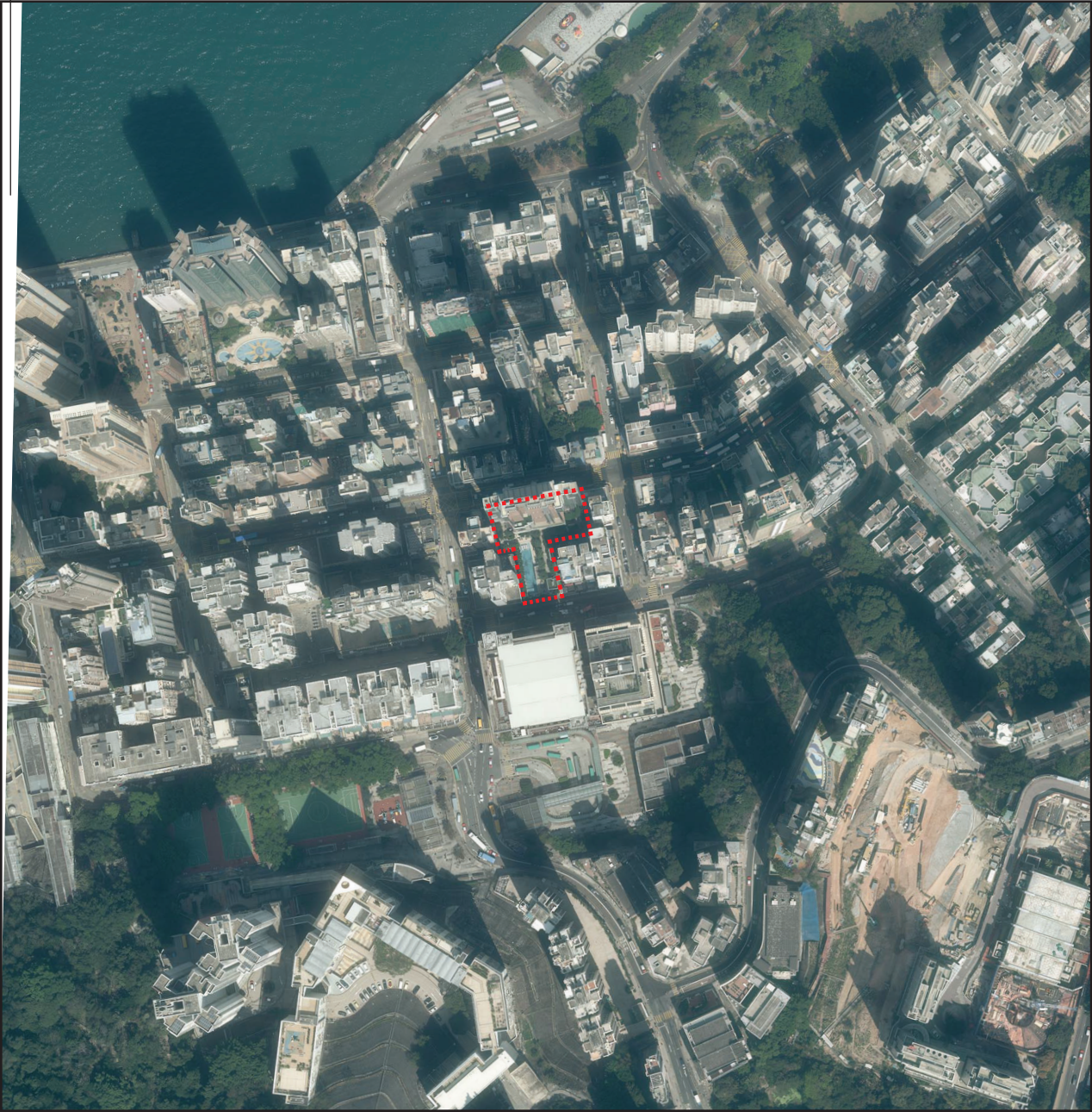
Location of the Development 發展項目的位置

This blank area falls outside the coverage of the aerial photograph 鳥瞰照片並不覆蓋本空白範圍